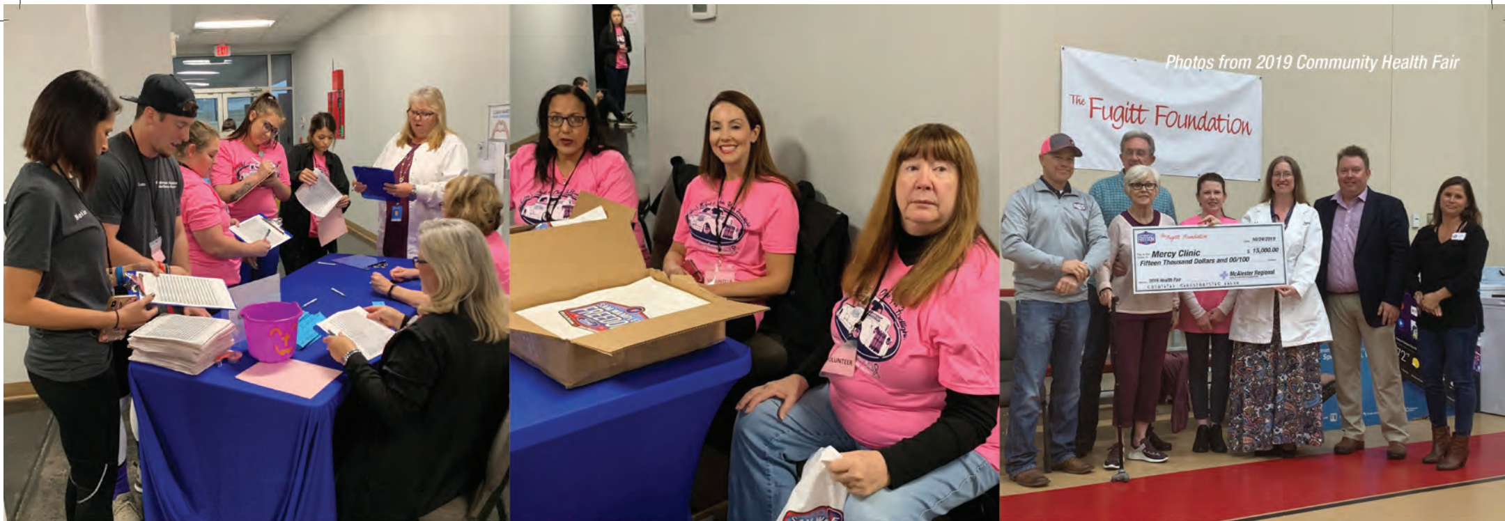
Photos from 2019 Community Health Fair